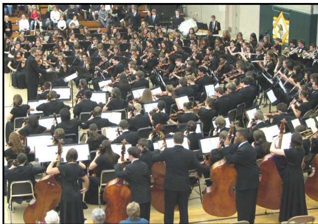
Photo from String Extravaganza 2007